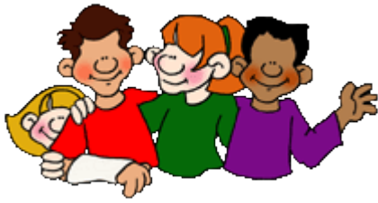
Table Favor Committee

We will not be meeting in April since we worked ahead in March. Our next session will be in May. Have a Happy Easter!